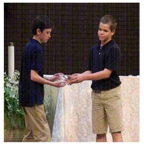
God bless you and have a safe and relaxing summer spent with family and friends.