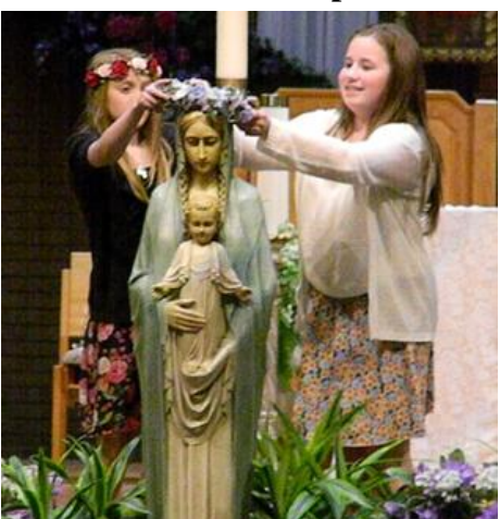
May Crowning on Grandparents day.